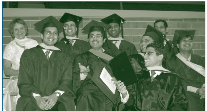
M. S. students are all smiles at commencement

market most receptive. They are finding employment with major companies across the nation and being accepted for study at the Ph.D. level by some of the best graduate programs in the country. One returned home where he is employed in India's strong and highly competitive computing industry.