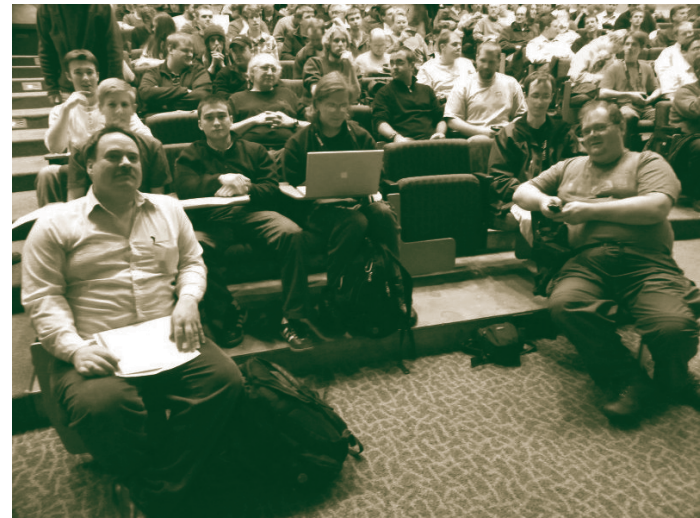
ACM clubbers and ITSS staffers preparing for Richard Stallman talk in October