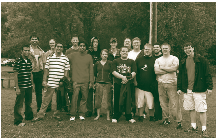
ACM club picnickers pose after playing Ultimate Frisbee in the rain in September