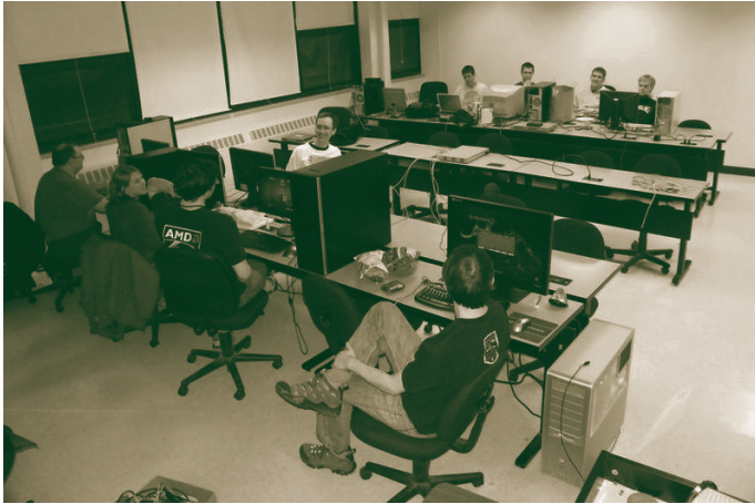
ACM Club LAN party in May

Our student ACM club was quite active in 2008, creating a new web site, hosting LAN parties and picnics, taking part in programming contests, and traveling to UMTC for a presentation.