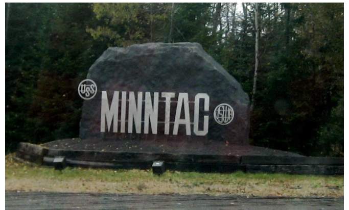
Minntac, a U.S. Steel facility, is located in Mountain Iron, MN. Its main operations are raw material mining and processing